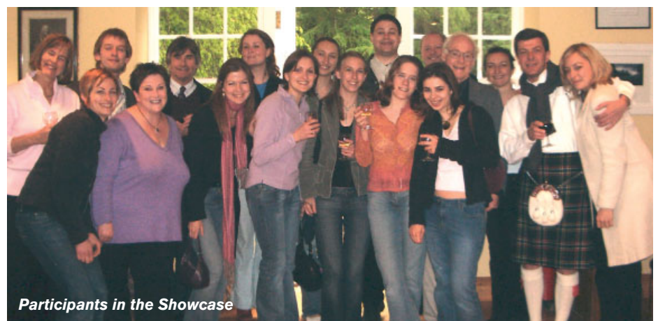
Participants in the Showcase